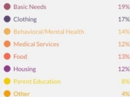
Referrals to Community Agencies & Services